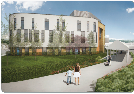
▲ PAEDIATRIC OUTPATIENT AND URGENT CARE CENTRE TALLAGHT HOSPITAL