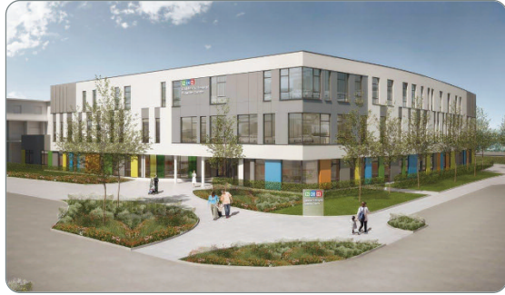
▲ PAEDIATRIC OUTPATIENT AND URGENT CARE CENTRE CONNOLLY HOSPITAL