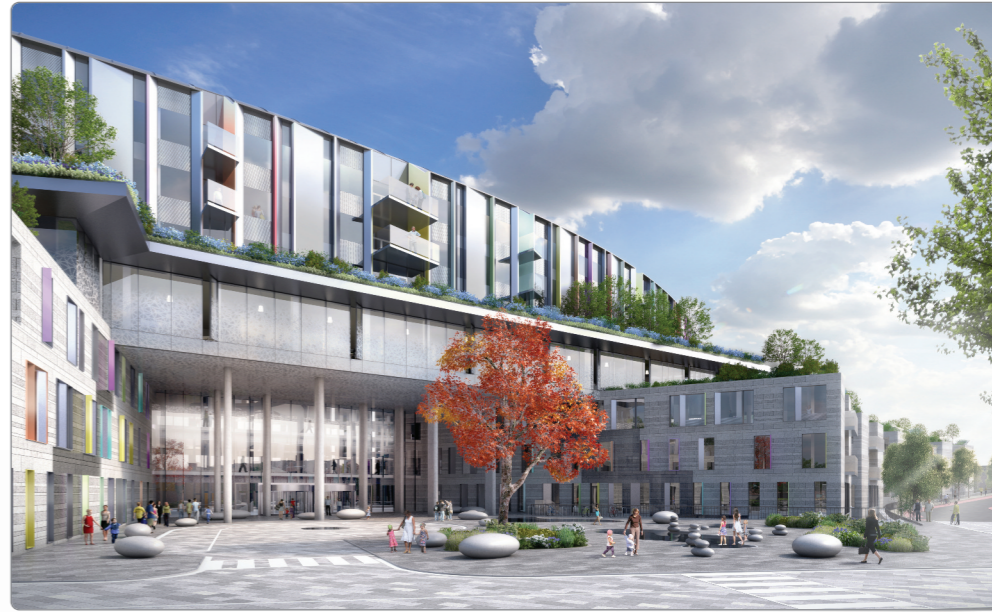
▲ PLAZA AT SOUTH CIRCULAR ROAD