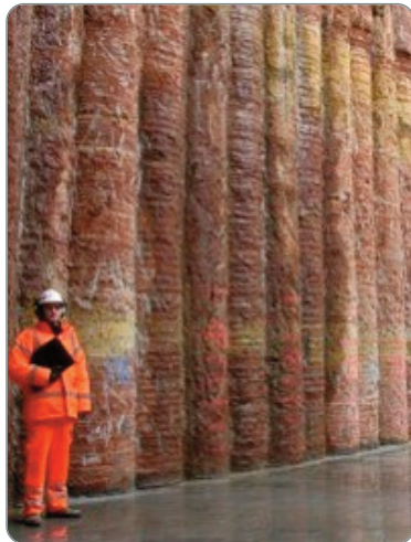
▲ BASEMENT WALLS ARE FORMED USING SECANT PILES A MAJOR ADVANTAGES OF THIS METHOD IS THAT IT IS LESS NOISY THAT OTHER PILING