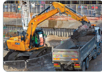
▲ EXCAVATOR LOADING LORRY