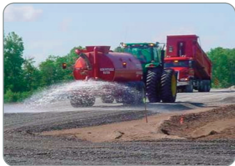
▲ WATER SPRAYER