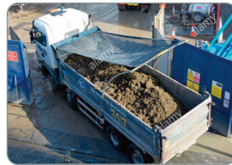
▲ COVERED BODY LORRY