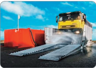
▲ TRUCK WASHING SYSTEM